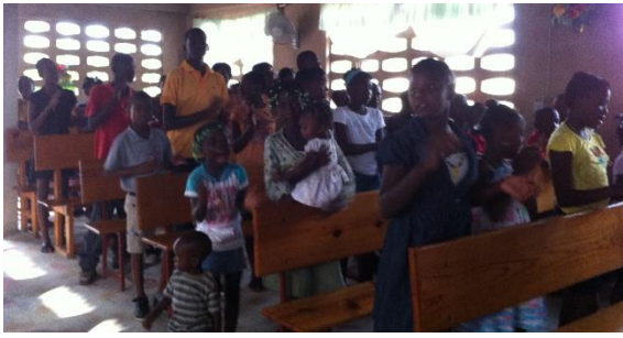
VBS in July 2013