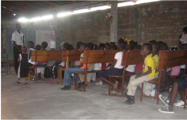
VBS in July 2007